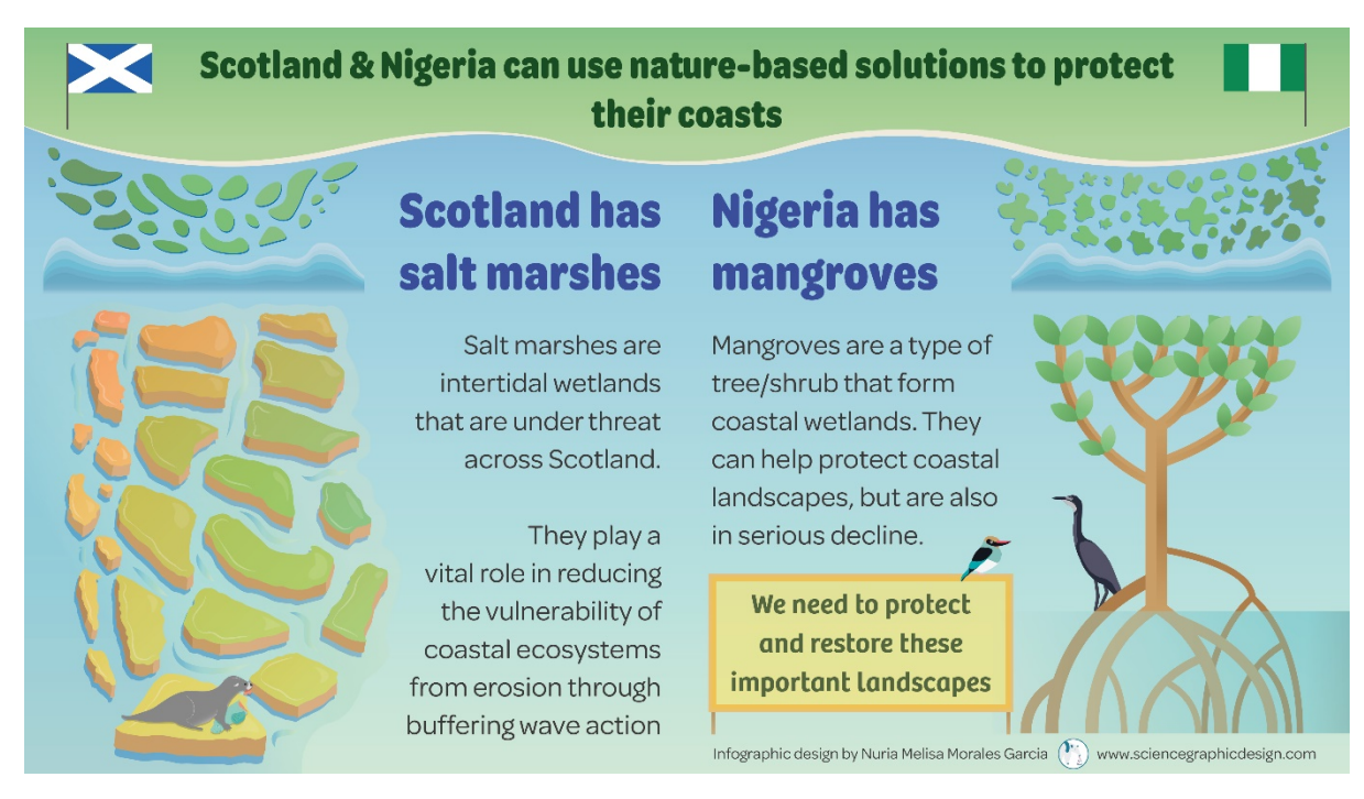
Figure 4: Social media ready graphic showcasing the different types of wetlands in Scotland and Nigeria.