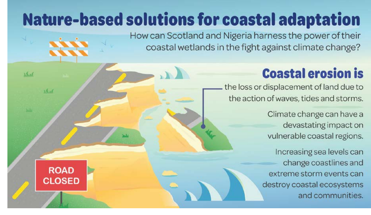
Figure 2: Social media ready graphic on nature-based solutions for coastal adaptation.